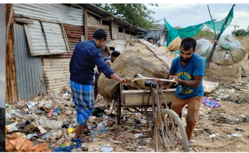
Absence of drainage and inadequate protection from rain in informal settlements lead to loss of income and increased workload for informal waste workers in Bangalore, India.