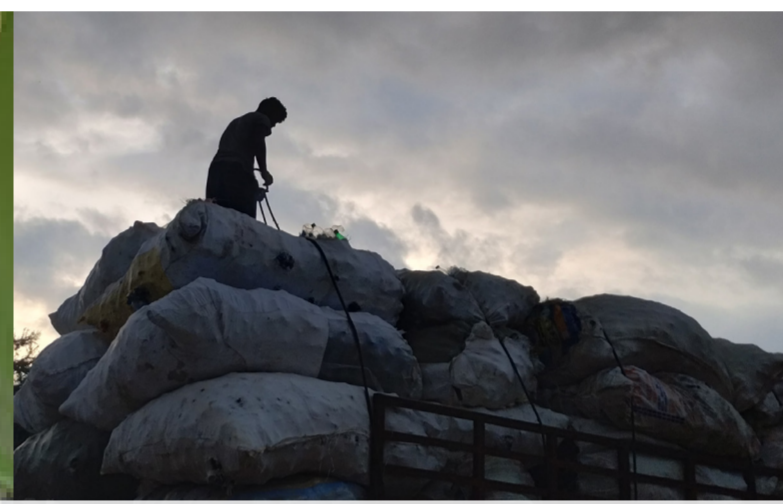
Male waste workers loading recyclable waste after segregation into trucks for sale up the value chain. Bangalore, India.