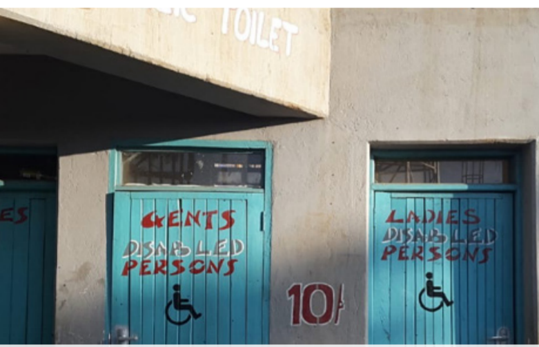
Pay for disabled toilets with locks removed, Viwandani, Nairobi.

The ARISE hub aimed to enhance accountability and improve the health and wellbeing of marginalised populations living in informal urban settlements. We employed community-based participatory research with communities in urban informal settlements across Bangladesh, India, Kenya and Sierra Leone to explore WASH-related vulnerabilities and actions for change. These data draw on participatory methods including community-mapping, transect walks, daily diaries, interviews, governance mapping, surveys and photovoice. We analysed data thematically and applied an adapted version of Galtung's (1969) violence framework 1 .