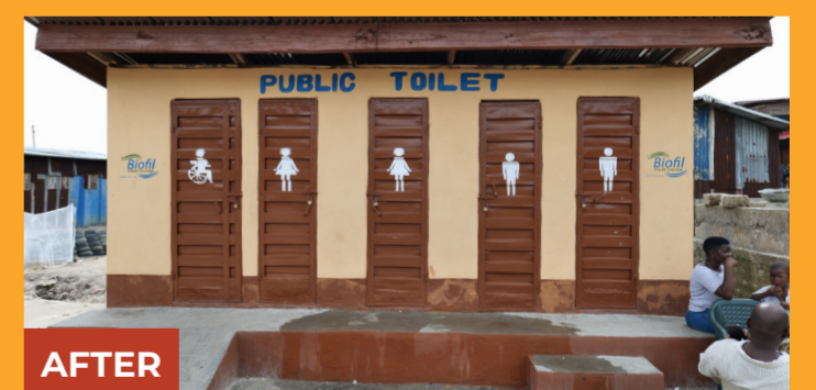
Credit: Cockle Bay, Freetown. Biofil toilets built with ARISE Responsive Funding in response to community priorities highlighted across the research lifespan.